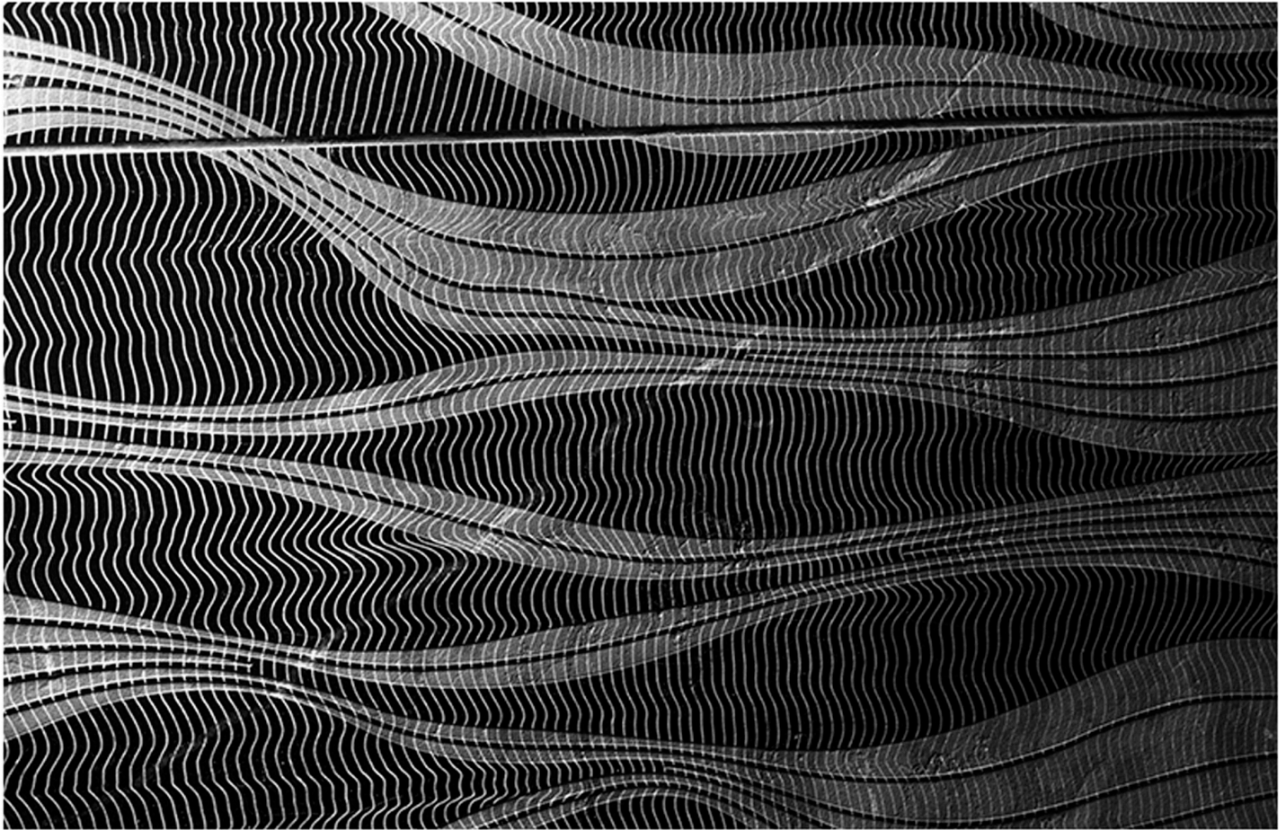
The River pattern in the Night Shadows colorway. This look is rendered in China Black marble.

“When Artistic Tile first proposed this collaboration, I knew our studio could bring something to them that they didn’t currently have in their portfolio,” explains Weitzner. “Organic, textural looks are something that our studio does very well. For Forest and River, we created a lot of preliminary looks through painting, drawing, and paper folding. Then we worked with Artistic Tile to narrow down the selection.”